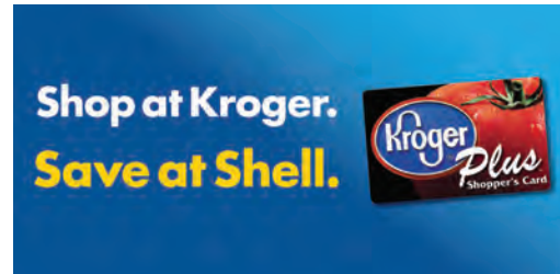
ROOFTOP BALLOON BANNER (if applicable)

Your POP kit does not contain the Nitrogen Enriched HOSE FLAG INSERTS shown in this planogram. Please continue to display the Kroger Fuel Discount HOSE FLAG INSERTS at the dispenser.